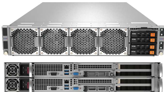
A+ Server 2114GT-DNR